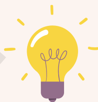
High Energy Demand