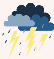
Major Weather Events and Natural Disasters